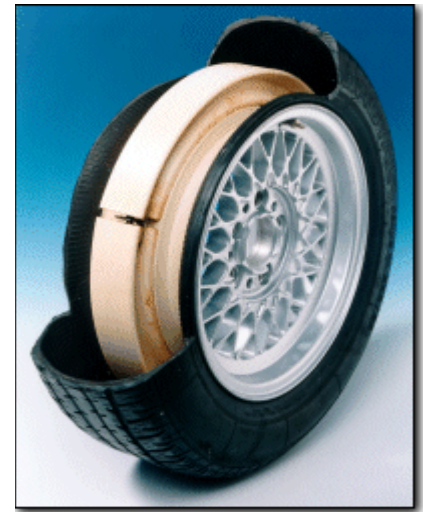
Run Flat Tyre Option